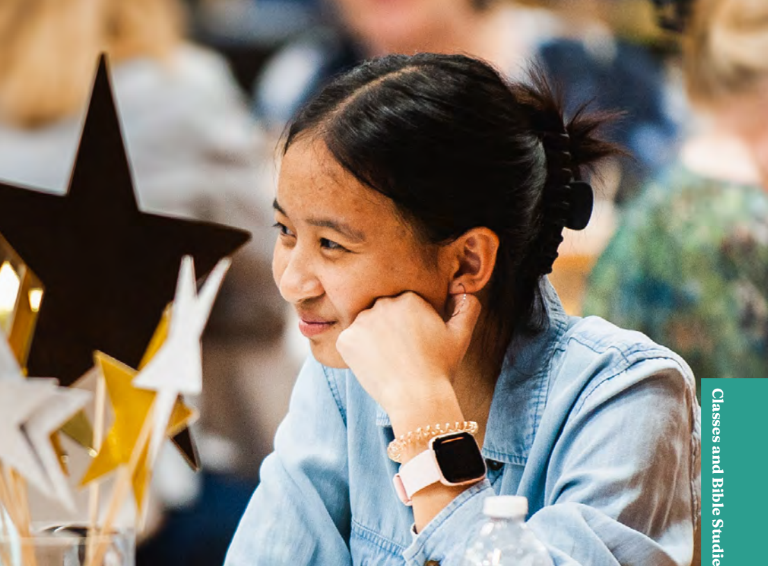
Classes and Bible Studies